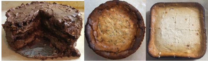
L-R: original sugar-free death by chocolate cheesecake; original standard Butterfinger® cheesecake; original standard cherry amaretto Simples

Our 9” cheesecakes are prepared with all-natural ingredients; and the preparation process never starts until after you order them. Many of our flavors are not listed because we have such a wide variety on hand that there are few flavors we don't have. If you would like a variety that we do not have on hand after all, we will do whatever we have to do to make it happen.