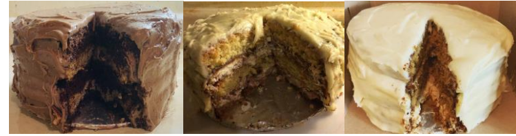
L-R: original standard peanut butter chocolate special cheesecake; original standard strawberry shortcake cheesecake; original standard banana pudding special cheesecake